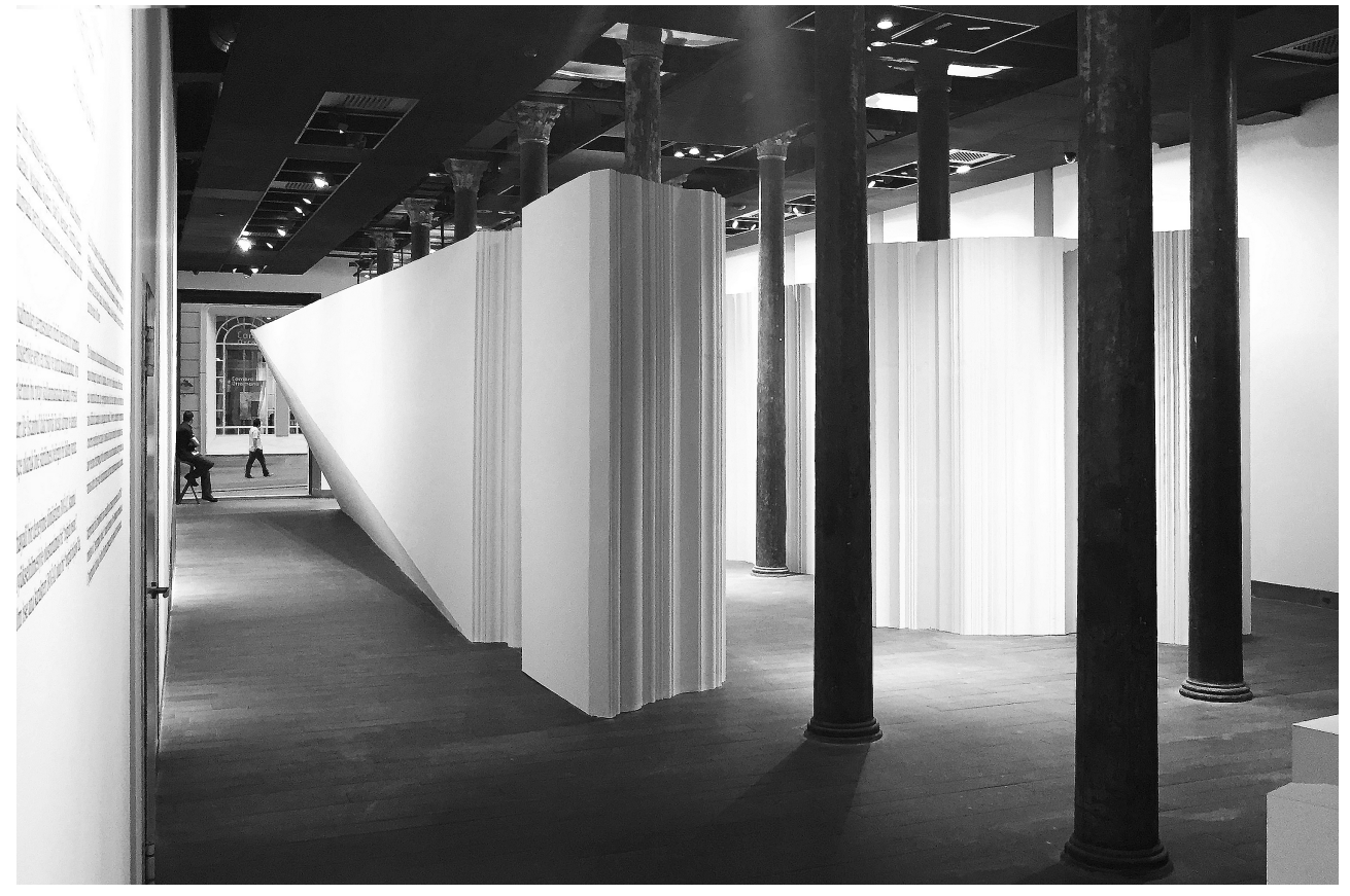
Figure 3: NEMESTUDIO, STRAIT Installation, 2015.

Despite the seriousness of the risk, contemporary environmental concerns regarding the transit of colossal oil tankers through this navigational route have been conflicted with the